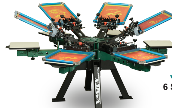
V2HD-66 6 Station/6 Color