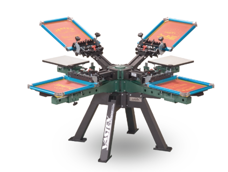
4 Station/4 Color