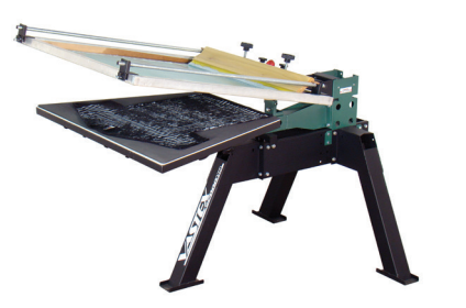
1 Station/1 Color Allover Press