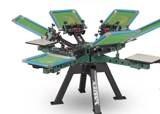
V2HD-46 4 Station/6 Color