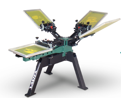
1 Station/ Color