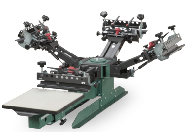
1 Station/4 Color Tabletop Press